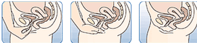
Step 4: NuvaRing® can be positioned anywhere inside the vagina.

***Remember, only a latex condom or polyurethane condom can protect you from HIV infection and other sexually transmitted diseases.