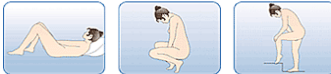
Step 2: Choose a position that is comfortable for you.

The exact position of NuvaRing® in the vagina is not important for it to work , and the muscles of the vagina should keep NuvaRing® securely in place. Most women don't feel NuvaRing® once it's in place (while the nerve endings in your outer vagina are very sensitive, the ones in your upper vagina are not). If you feel NuvaRing®, use your finger to gently push it further in -- there's no danger of NuvaRing® being pushed too far up in the vagina. Once inserted, keep the contraceptive ring in place for the length of time you've discussed with your clinician. NuvaRing® cannot get lost inside of you. You can't push NuvaRing® any further than the end of the vagina blocks it from going any further.